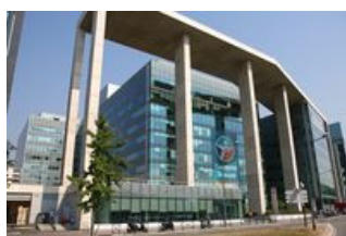
Arcs de Seine