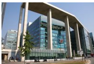
Arcs de Seine