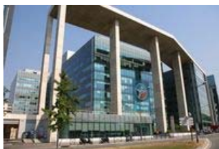
Arcs de Seine